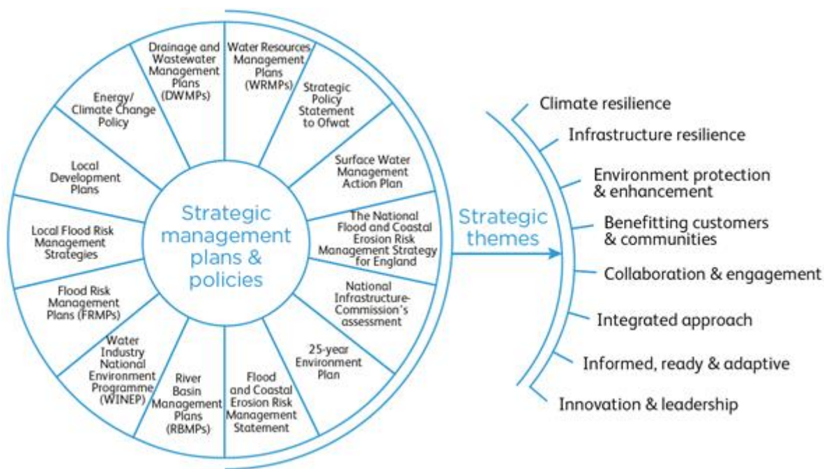
Figure Y - 2: Climate change in the WRMP and DWMP baseline projections