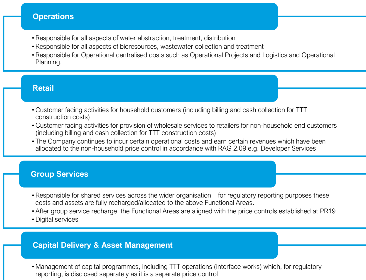
Figure 2 - Functional Areas