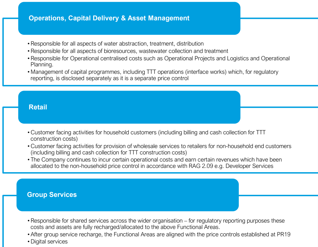
Figure 2 - Functional Areas