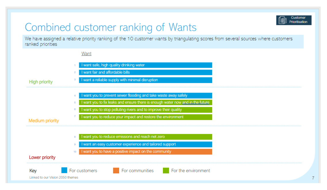
Figure 1: Combined Customer Ranking of Wants

Among the top five wants are the need for a constant supply of safe, high quality wholesome drinking water at good pressure, fair, affordable and accurate bills, fix leaks and reduce wasting drinking water, prevent sewer flooding into my property and provide and a reliable sewerage system that works 24/7<sup>3</sup>.