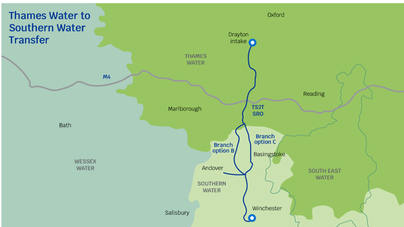
Figure 1. Thames Water to Southern Water Transfer Solution Schematic

For the 50MI/d capacity, all water is supplied to Kingsclere and Andover water resource zones and there is no direct T2ST connection to Winchester.