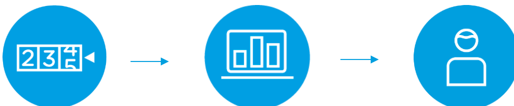
FIGURE 1: DATA FLOW FROM METER TO CUSTOMER

Digital meters use the smart network in London and through the local communication equipment (LCE) transmit readings to our secure Meter Data Management System. Meter readings are stored there and used by Thames Water for billing purposes and leakage detection. They can also be shared with customers (Retailers and third parties) through our